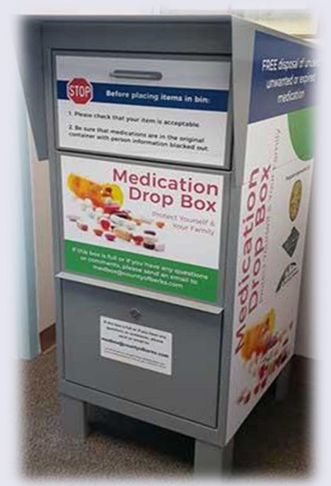
Visit cocaberks.org for more information